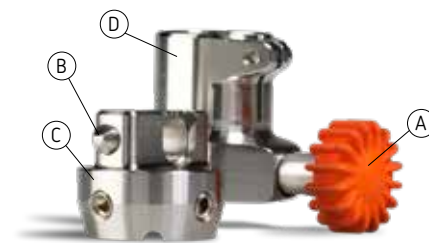
Open and divided position. Example shows combination Quick Fit unit 30 mm tube and Base Female.